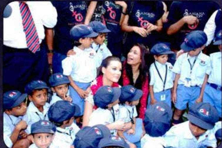
Children at G4S HQ with Miss Universe at the Campaign