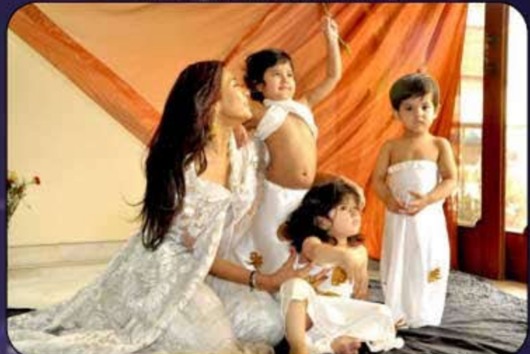
Celebrate the Girl Child Photo Shoot