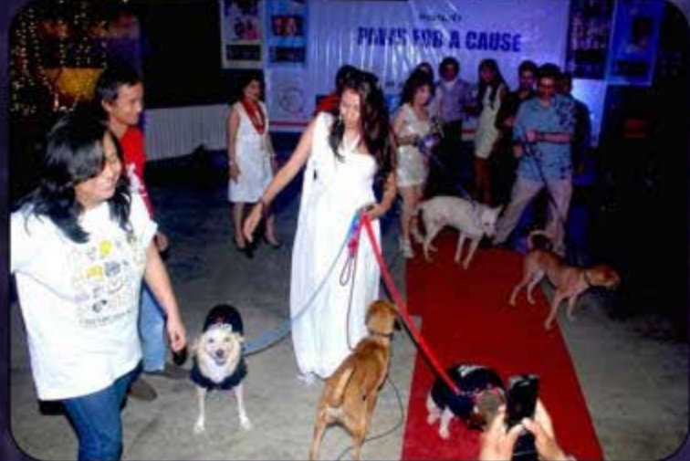
"Paws for a Cause" Show with (Peta)