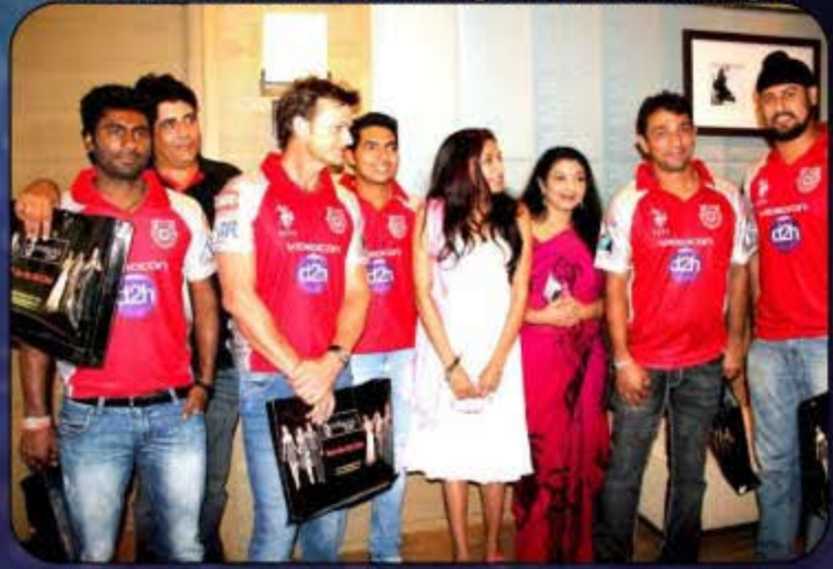
First Blind T-20 World Cup in Bangalore with Team Kings11