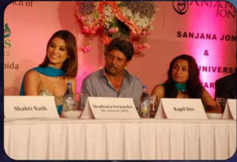
"AIDS Awareness" Campaign with Kapil Dev and Miss Universe