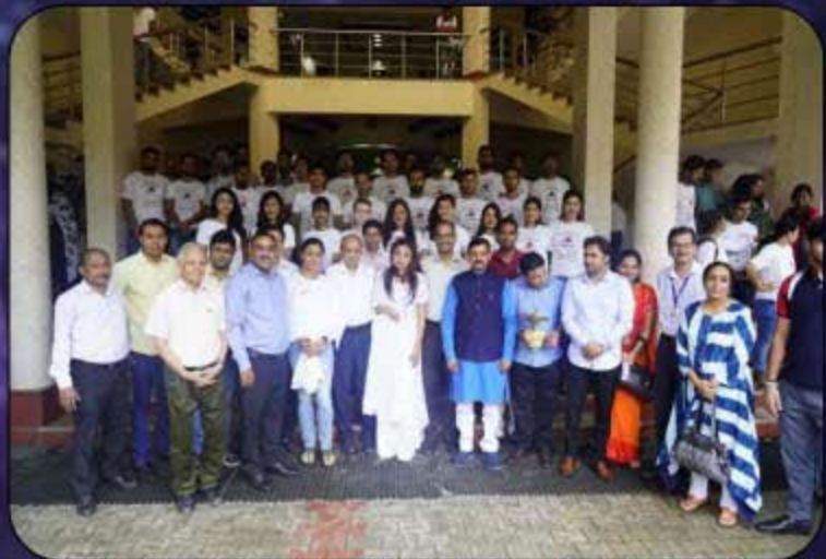
Walk For Water Movement In Parmarth Ashram (Rishikesh)