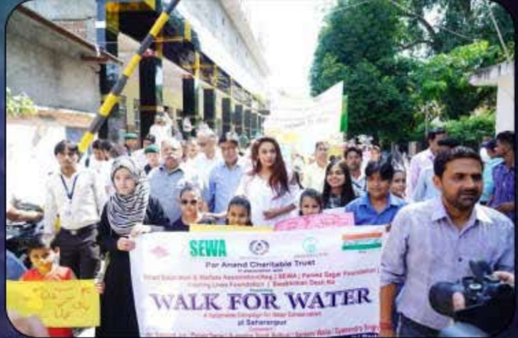
International Environment Summit & Awards